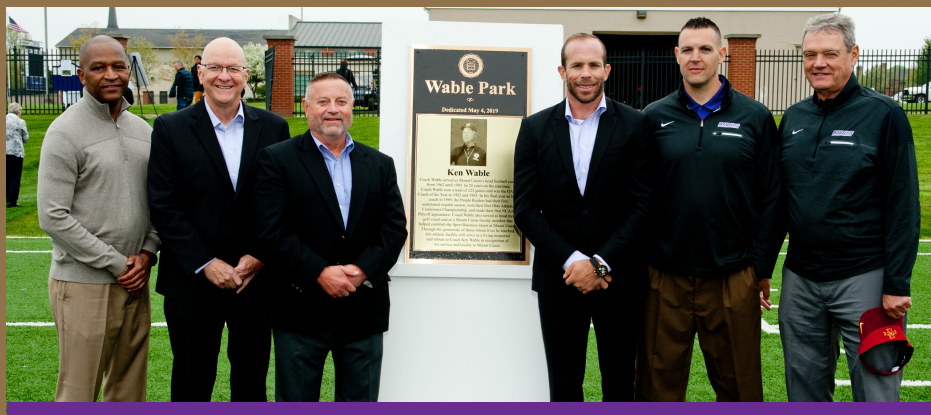
Wable Park and Sean M. Moore Field